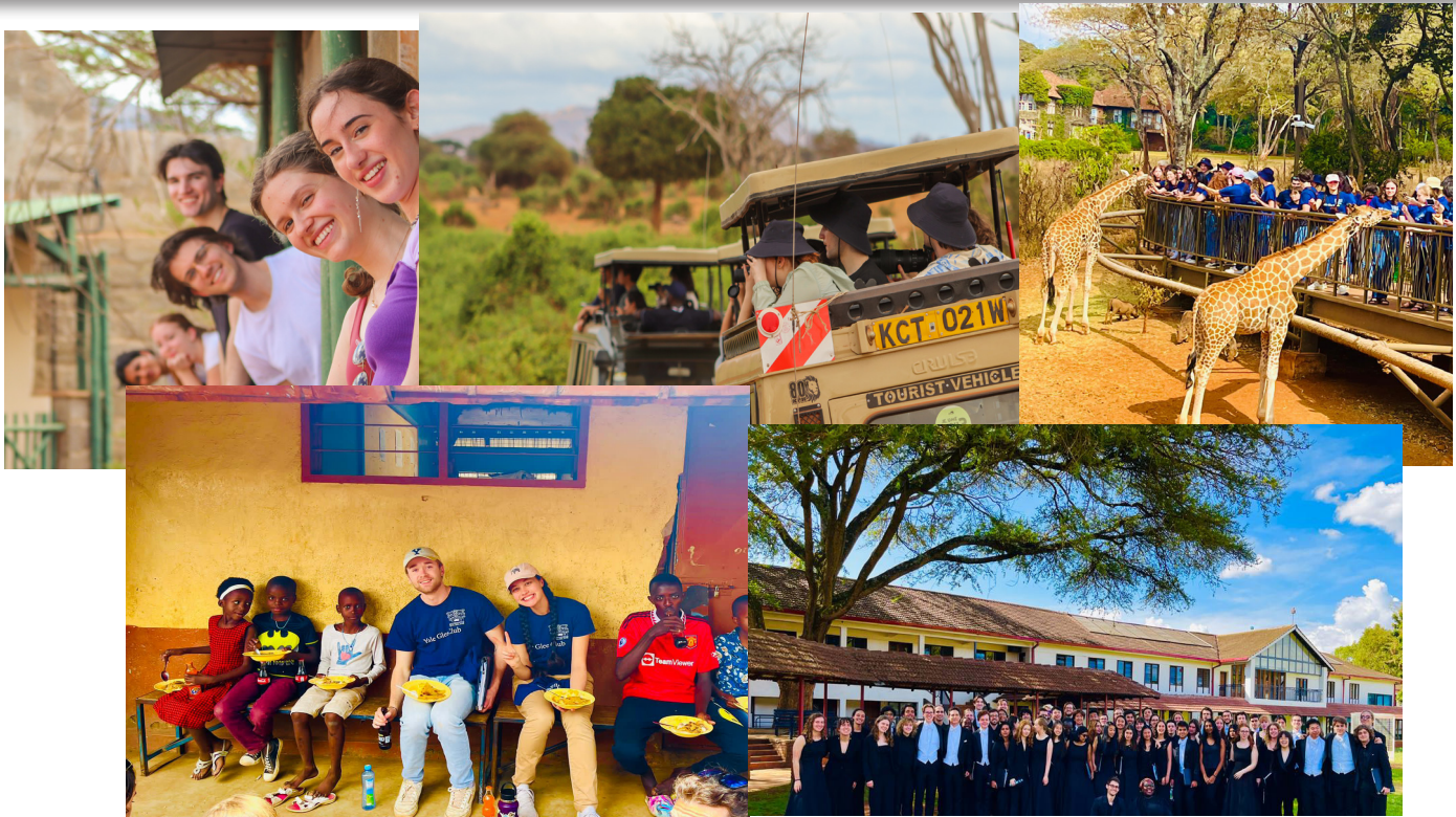
Photos from Kenya Tour!

Our tour would have been incomplete without a visit to East Tsavo National Park, where we embarked on safari game drives. Our group saw elephants, giraffes, zebras, lions, cheetahs, baboons, hippos, ostriches...the list goes on. It was an unforgettable experience all around!