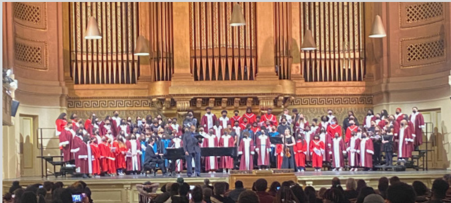
Annual High School Music Festival, April 2023