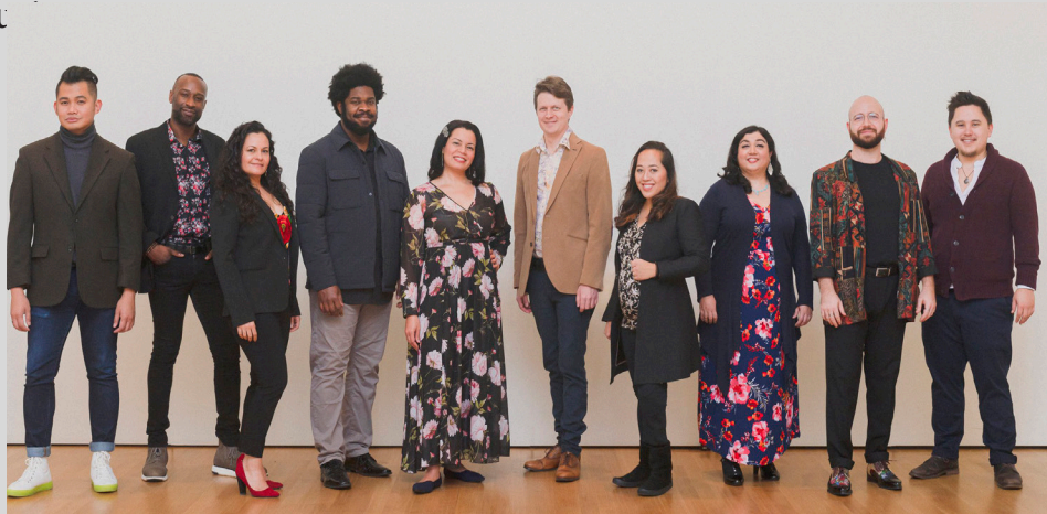
Kaleidoscope Vocal Ensemble